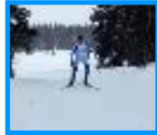
GMN LOPPET REPORT PAGE 3