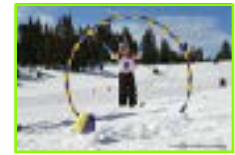
YOUTH PROGRAMS PAGE 6