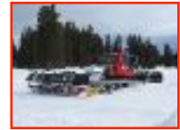
THANK YOU, DONORS! PAGE 6