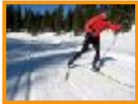
ADULT PROGRAMS PAGE 2