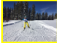
YOUTH PROGRAMS PAGE 4