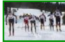
WINTERSTART RECAP PAGE 5